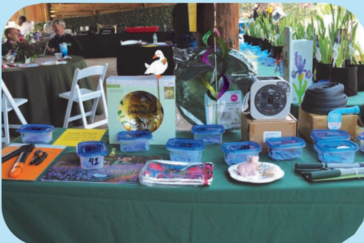
Bottom right: iris up for raffle