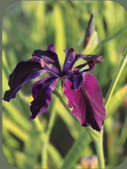
Best Louisiana cultivar - 'Black Widow' (W.B. MacMillan, 1953)