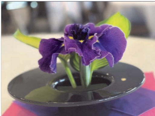
Photos taken at the AIS National Convention 2024 in Portland, OR.