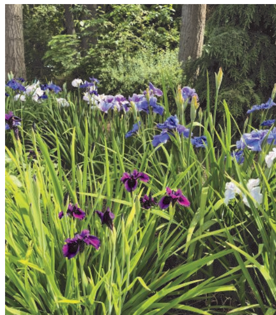
Above: Beth at Mt. Pleasant Iris Farm. Right: Mid-America Gardens