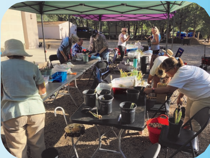
Left top, middle and right photos: PAIS work parties to help dig, clean, sell and pot up rhizomes