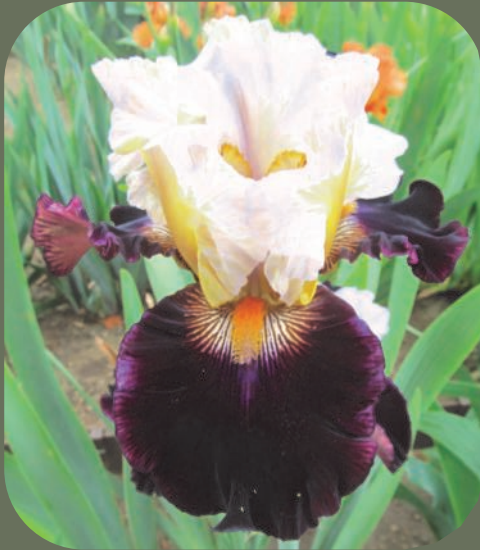
Best seedling from outside of AIS Region 15: Seedling 19-3I-A by Jim Geditz

Photo credits: Olga Batalov, except Fortune seedling and 'Black Widow' (Beth Train)