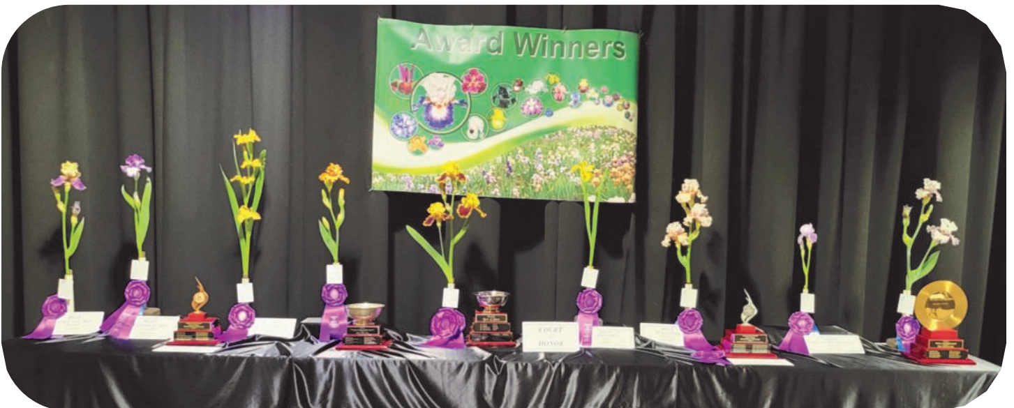
Bottom: The best of the best from the spring show

facebook.com/SouthernCalifornianIrisSociety