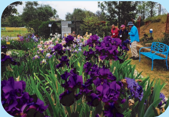
Bottom right: Spring Trek attendees enjoying each other's company